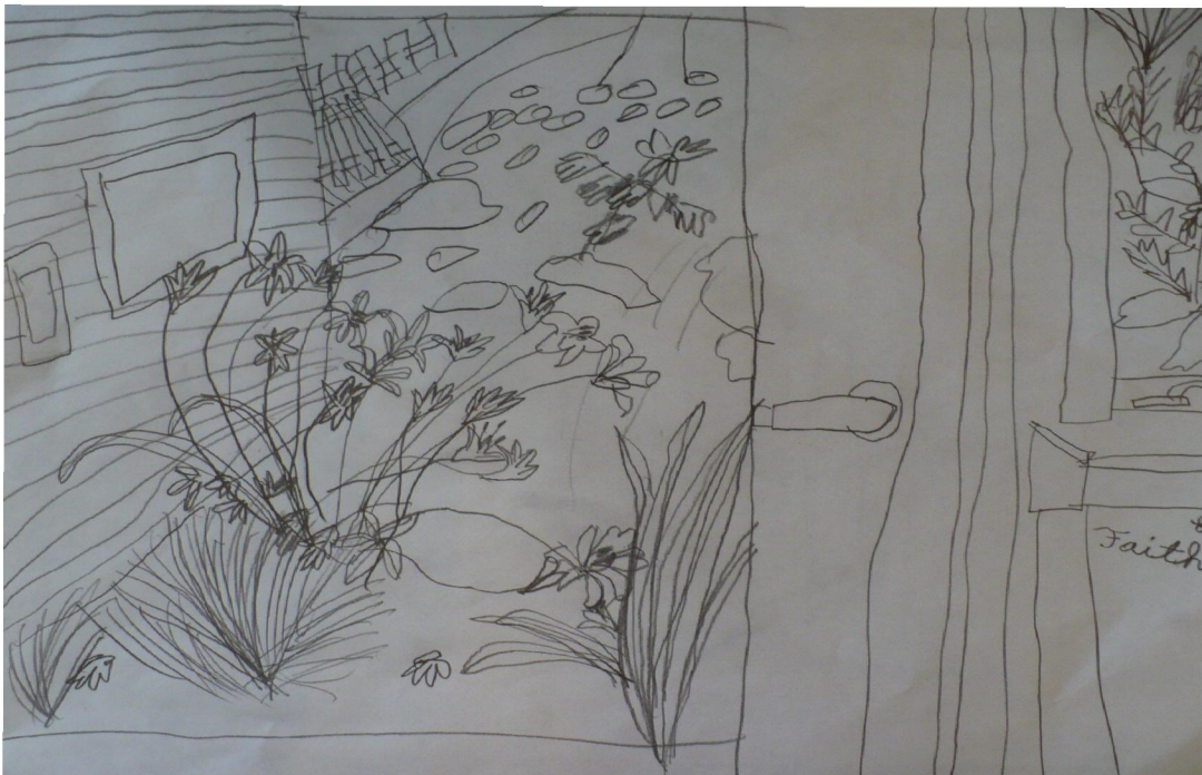
View from Bethel by Faith Vileniskis