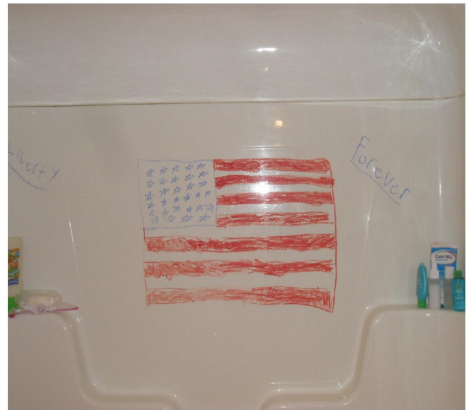
Bathtub Art Found during Cabin Inspections

We know that there are more campers out there with hidden talents, so we implore you to participate early and often. Let's face it, you don't have a tough act to follow!